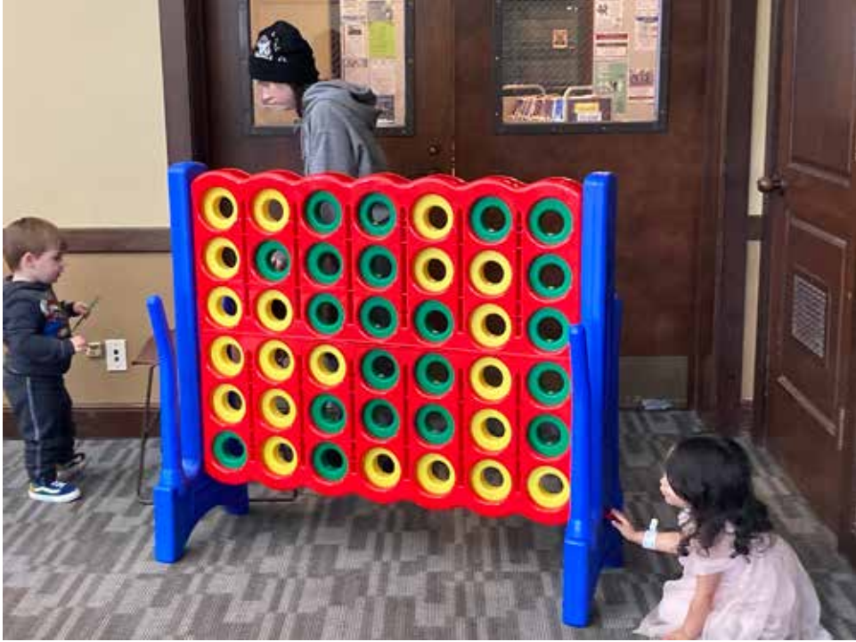
Kids of all ages are attracted to this large Connect Four game that was purchased for the library by the Friends using proceeds from book sales & dues.