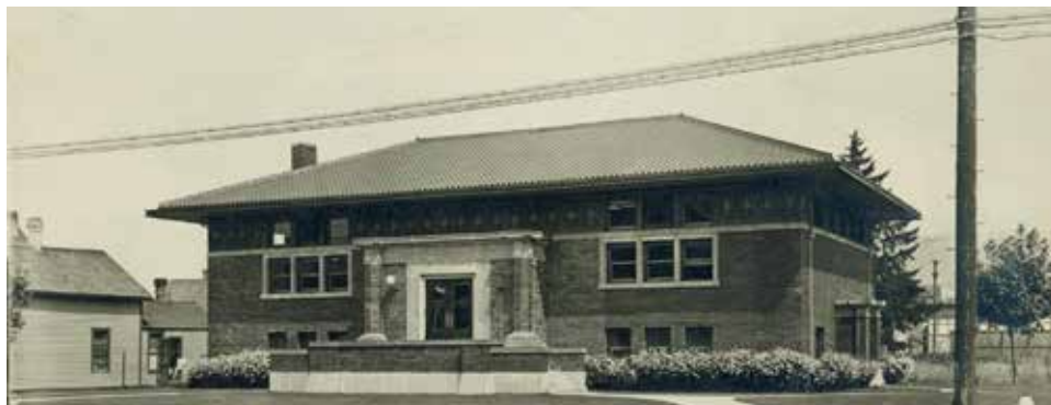
Photo of Hoquiam Library can be found in Polson Photo Collection.

A pandemic, protests, and economic jolts ushered in the so-called "Roaring Twenties." Americans adjusted in ways both innovative and counterproductive. What lessons from the 1920s can we apply to our own looming 20s?